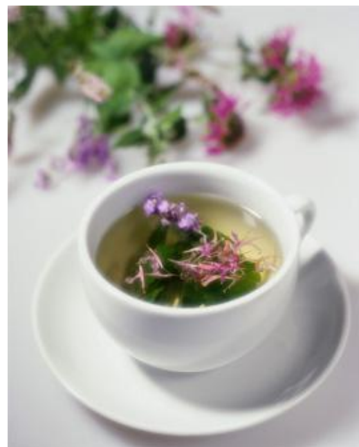
Girls State Tea, May 4, 2014, 1:00pm at Post 507