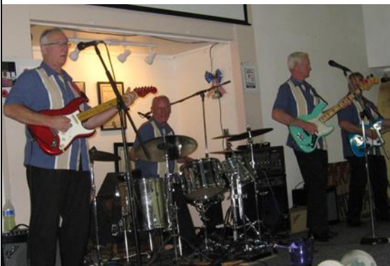
The guests rocked and rolled to the music of the Sound Waves. The group graciously donated their time.